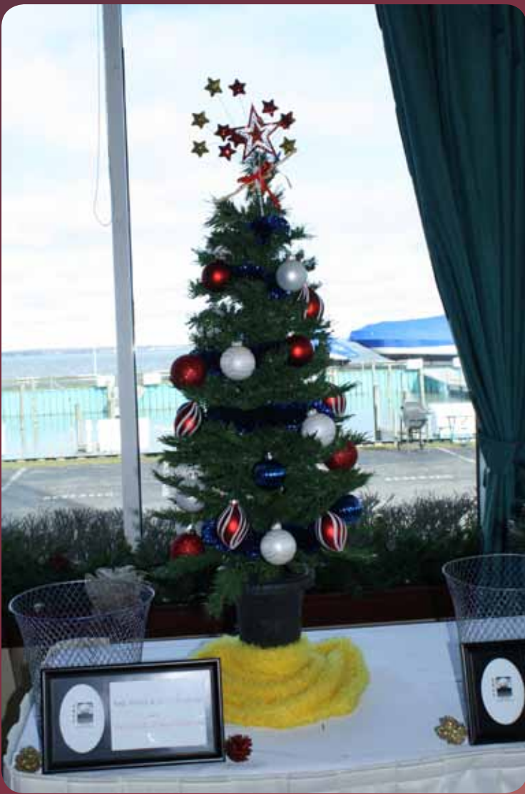
Red, White and Blue Christmas donated by McDonalds in New Baltimore